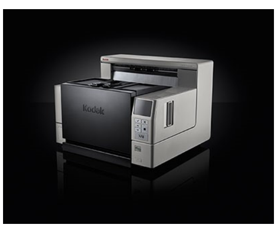
Mission Critical Recommend and Supply Kodak Production Scanners